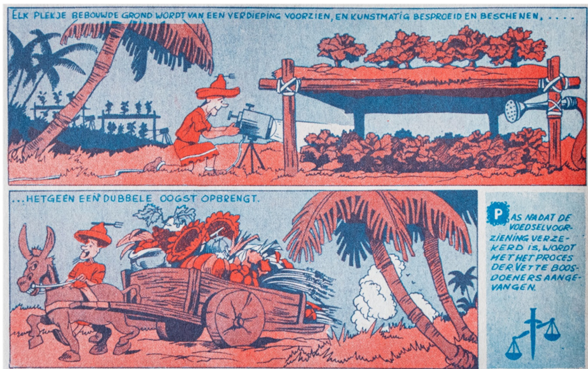
Figure 1. Two panels from the first Suske en Wiske (English: Spike and Suzy) comic strip Op het eiland Amoras by Willy Vandersteen depict a primitive vertical farm. The Belgian comic strip was published in De Nieuwe Standaard from 19, 1945 December to 13 May 1946. Its caption reads: “Every patch of cultivated land is storeyed and artificially watered and lit, yielding a double harvest.”